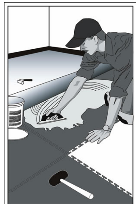
Floating subfloors like Smartdeck™ can be placed directly over old failing floors.

After small sections of flooring begin failing, the problem quickly spreads. The resulting mess can cripple a manufacturing operation. Tiles become loose, air entrainment bubbles develop in the tile or epoxy coatings followed by eventual black liquids oozing through cracks and seams. The failing floor becomes a safety hazard and traffic obstacle. Repairs are almost impossible because water vapor continuously rehydrates the repaired area, often before the new installation has had the opportunity to cure. After the problem first emerges, most companies that have experienced this problem find themselves replacing compromised sections on an ever increasing basis. The standard permanent “fix” for moisture problems usually does not get used since it would require a complete shutdown due to demolition and reinstallation of flooring. A permanent fix entails ripping up the failed floor, shot blasting the concrete, repairing imperfections, installing a moisture vapor barrier and then reinstalling new flooring. The cost for this cure could run as high as fifteen to twenty dollars per square foot depending on working conditions, this is exclusive of the cost of shutdowns, equipment moving and auxiliary support.