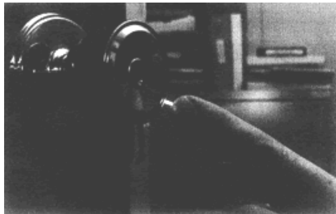
Figure 1. Simulated electrostatic discharge between a finger and a door knob.

Inexplicable problems occurring during very cold weather, for instance, are sufficient to make investigators suspect ESD interference. Once suspicion exists, the device manufacturer can be the best source of information. It has been the experience of the authors, however, that ignorance on the part of manufacturers' representatives regarding such problems should not be interpreted as conclusive evidence against ESD interference. Where the consequence of the interference is not dire, verification of the cause is often possible by monitoring natural repeat occurrences. If consequences are too potentially dangerous, artificial means of testing an ESD interference hypothesis must be contrived.