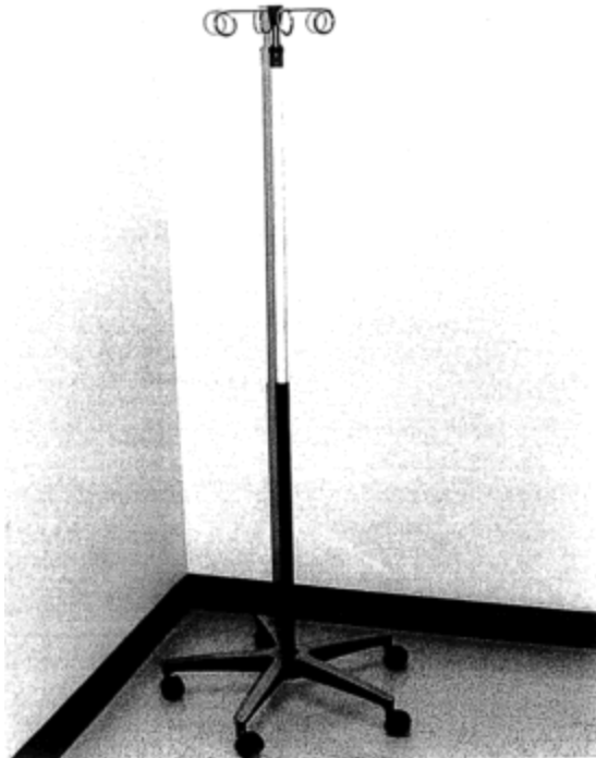
Figure 3. IV pole modified with an electrically insulative covering to reduce the probability of ESD to this device.

means of eliminating a recurring problem. When an IV pole was shown to act as an antenna for an EMI signal generated by ESD to the pole. For example, an insulative pole covering was employed.